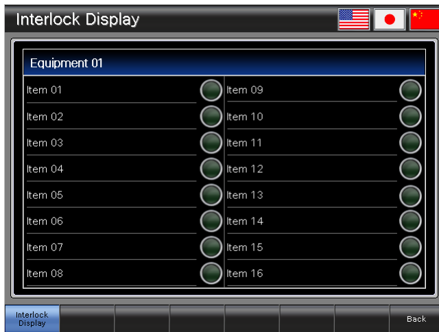
Base screen B-30001: Interlock Display 1