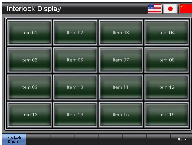
Base screen B-30002: Interlock Display 2